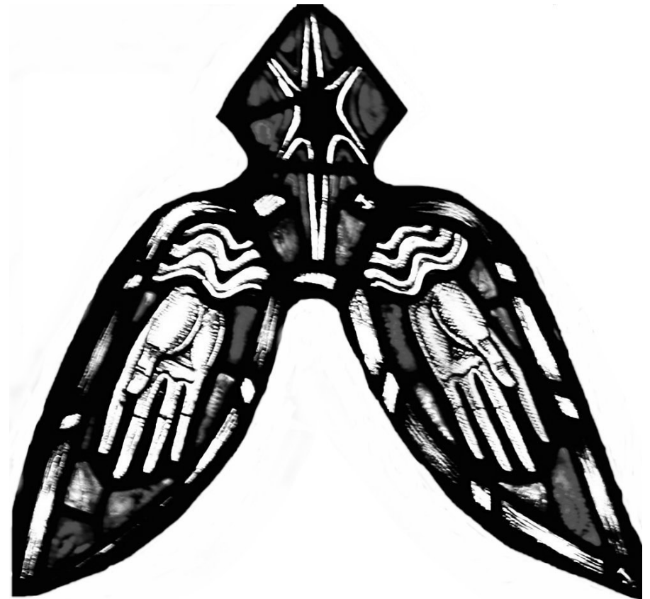
One of three stained glass motifs above the central window at St. Serf's depicting the hands of God extending from Heaven.